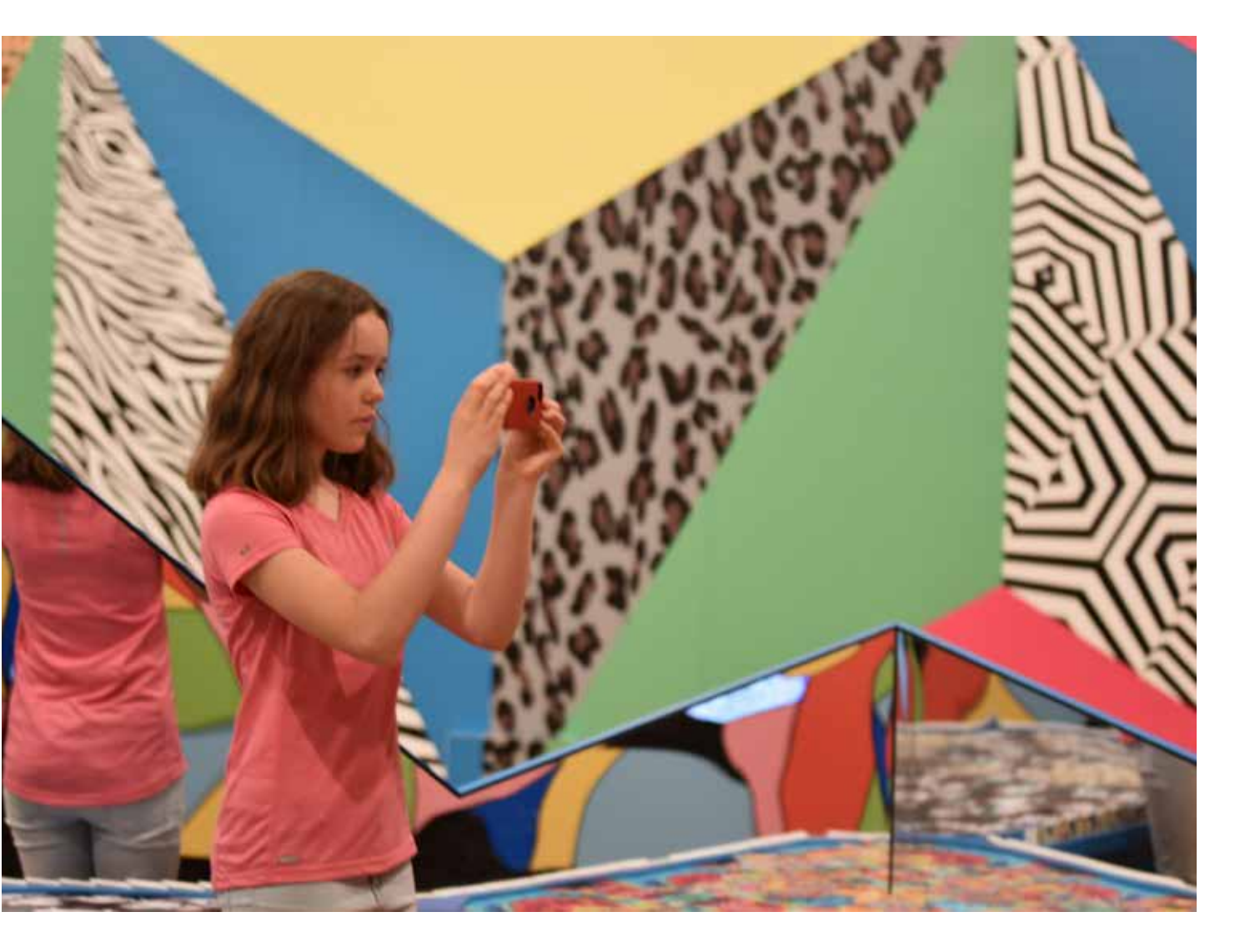
Image: Young guest at the official opening of the Tasmanian Museum and Art Gallery's Pattern Play exhibition. Jemima Wyman: Pattern Bandits