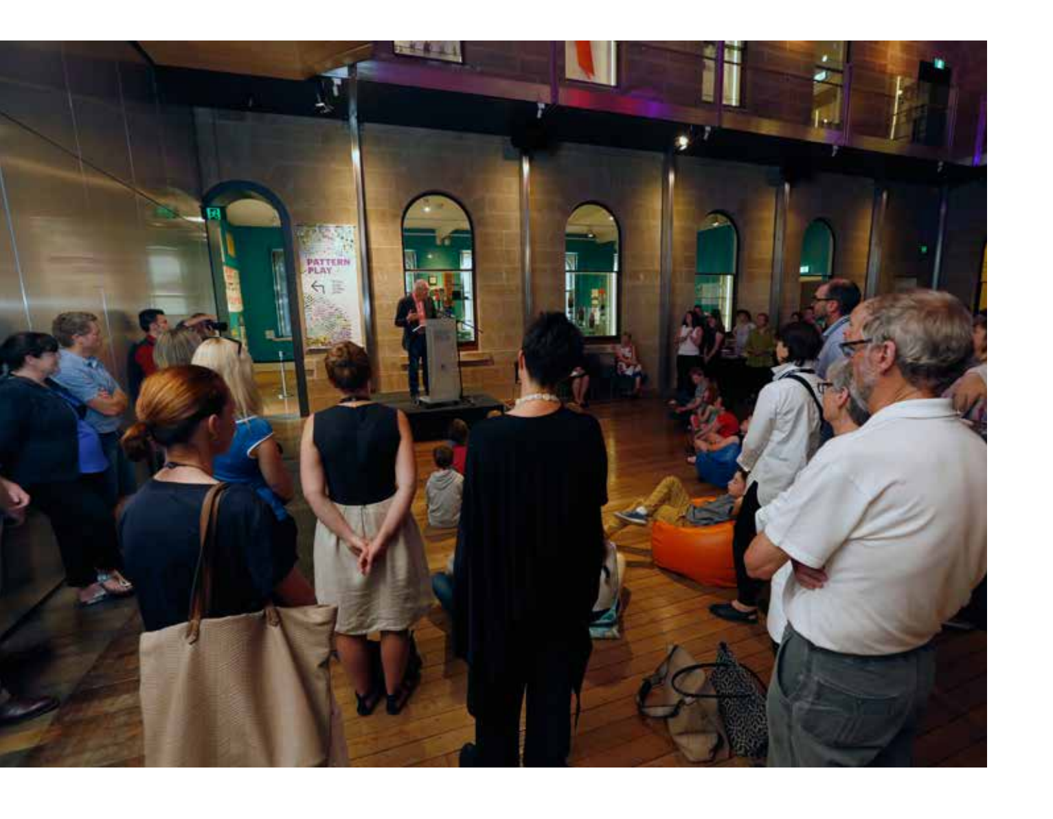
Image: Guests listen to the Commissioner for Children, Mark Morrissey speaking at the opening of the Pattern Play exhibition at TMAG.

I was invited to speak on 17 December 2015 at the launch of TMAG's interactive family exhibition titled Pattern Play which celebrated the wonderful world of patterns. •